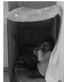
JM exploring the science center

"This must be what the Penguins feel like —" ML